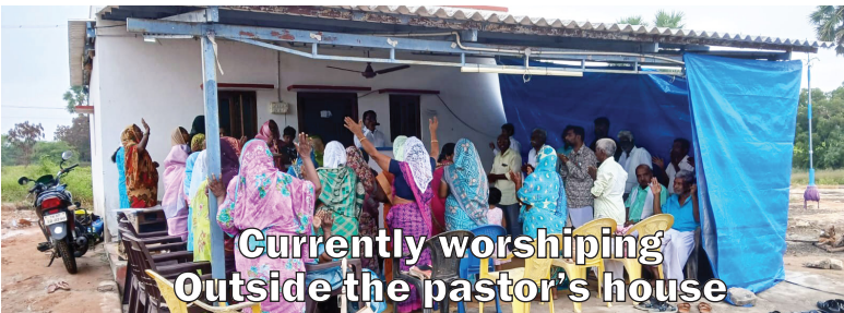
Currently worshipping Outside the pastor's house