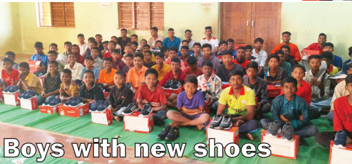
Boys with new shoes