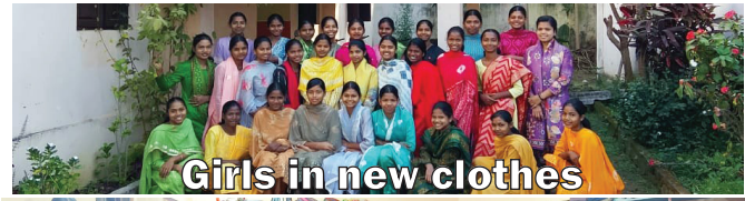
Girls in new clothes