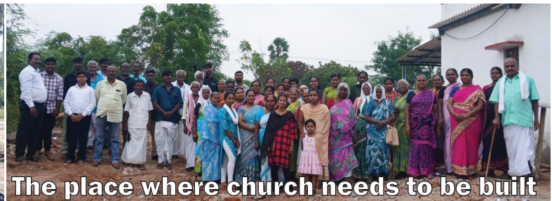
The place where church needs to be built