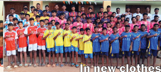
In new clothes and shoes